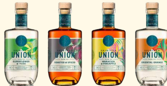
Examples of the end result ↩